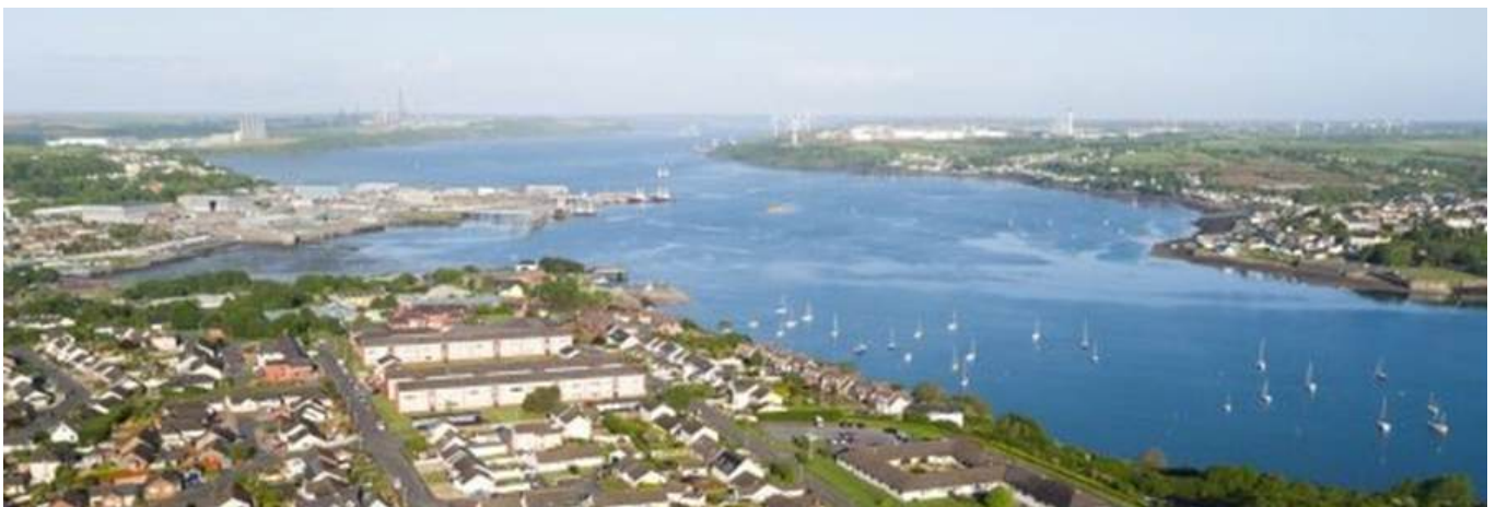
Aerial view of the Cleddau Estuary from Pembroke Dock, with the power station, an LNG terminal and the oil refinery just about visible in the background.

Up to 20% of the UK's energy is supplied by members of the Milford Haven Waterway Future Energy Cluster, which include energy companies, renewable developers and green technology innovators.