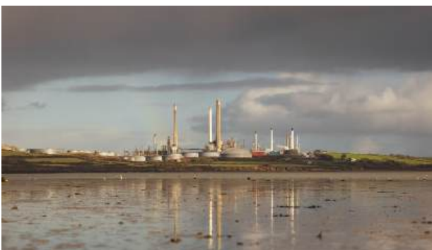
Valero Oil Refinery.

Pembrokeshire's different communities can be as diverse as its' landscape, and sometimes feel not very well connected with each other.