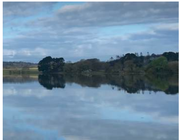
The Cleddau Project is campaigning to restore the health of our waterway from source to sea.

Like many places across the UK and beyond, Pembrokeshire's species and habitats are at risk from a variety of environmental pressures. These include pollution from industry, agriculture and urban areas, habitat loss and species mortality from development, climate change, disease and the challenges posed by invasive non-native species. The Cleddau river and Milford Haven waterway are considered to be in 'unfavourable condition'.