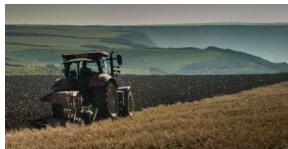
Coastal farmland.

Some have described Pembrokeshire as “Little England beyond Wales”, although this title can be considered offensive, particularly by those living north of the ‘Landsker line’ (see below).