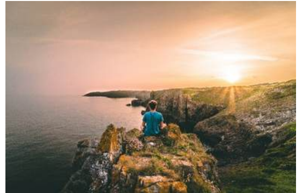
An idyllic image of Pembrokeshire, from the Visit Pembrokeshire image library.