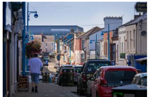
Dimond Street in Pembroke Dock, with one of the two large 'Sunderland Hangars' of the dockyard in the background.