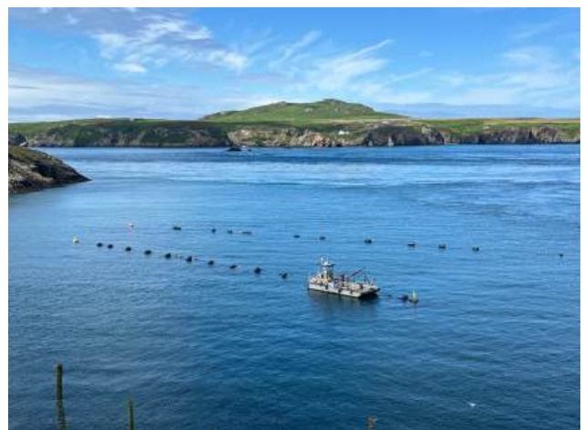
Câr-y-Môr aims to improve the coastal environment by regenerative ocean farming.

The main seafoods processed in Pembrokeshire are shellfish, predominantly crab and lobster.