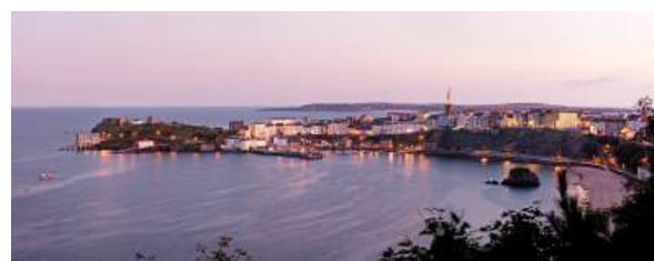
Tenby town and harbour.